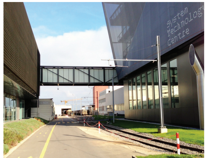
Nestle System Technology Centre | Orbe, Vaud, Switzerland Concept Consult Architectes