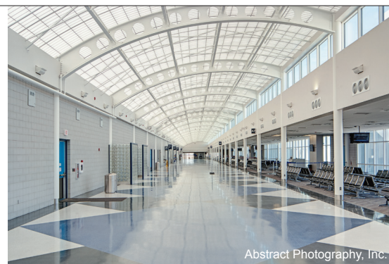
Abstract Photography, Inc.

WINDBORNE DEBRIS RESISTANT SKYROOF | BLAST RESISTANT SKYROOF | FM RATED SKYROOF | CLASS A ROOF